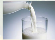
Low fat milk