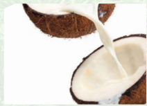
Coconut milk or cream