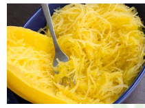
Spaghetti squash or wholemeal pasta